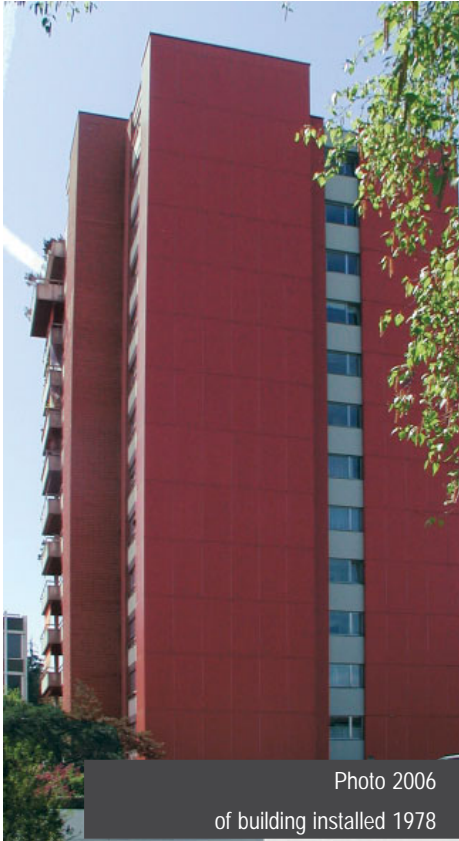
Photo 2006 of building installed 1978